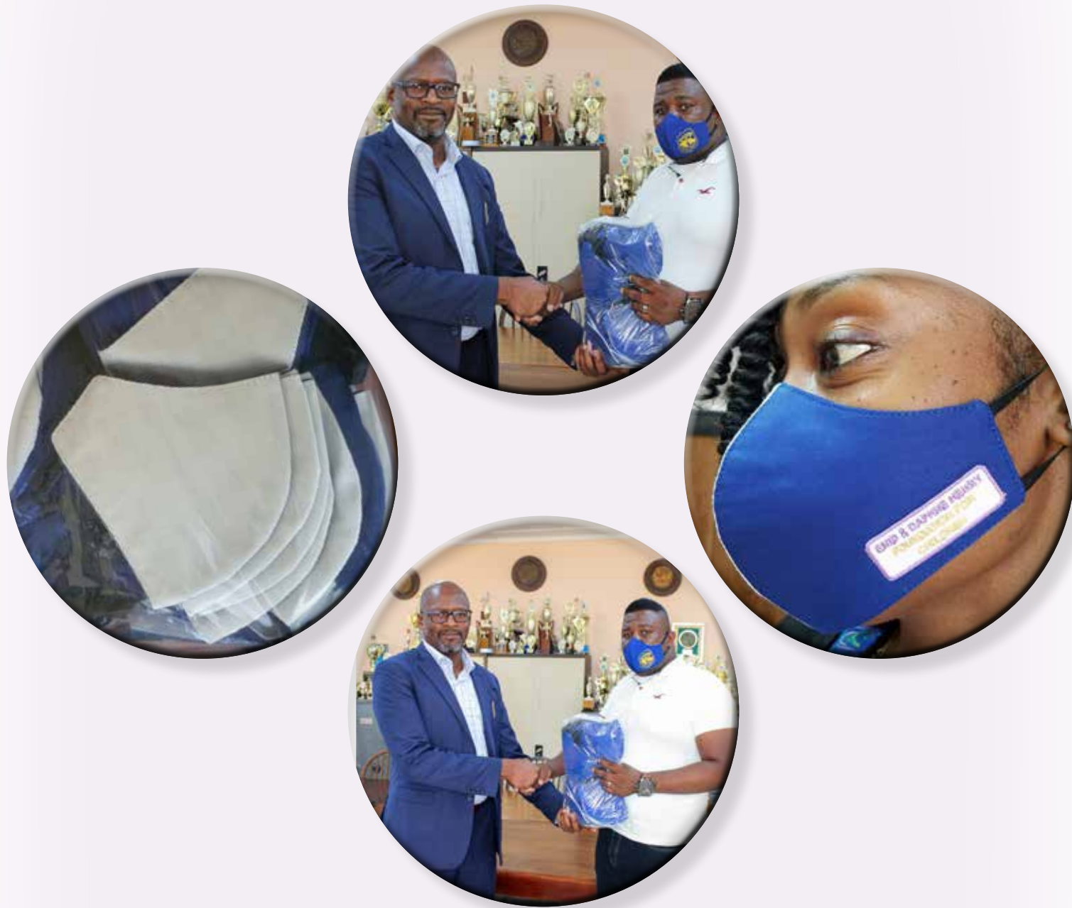
📍 Photos from our recent mask donation to the Clarendon College in Clarendon, Jamaica.