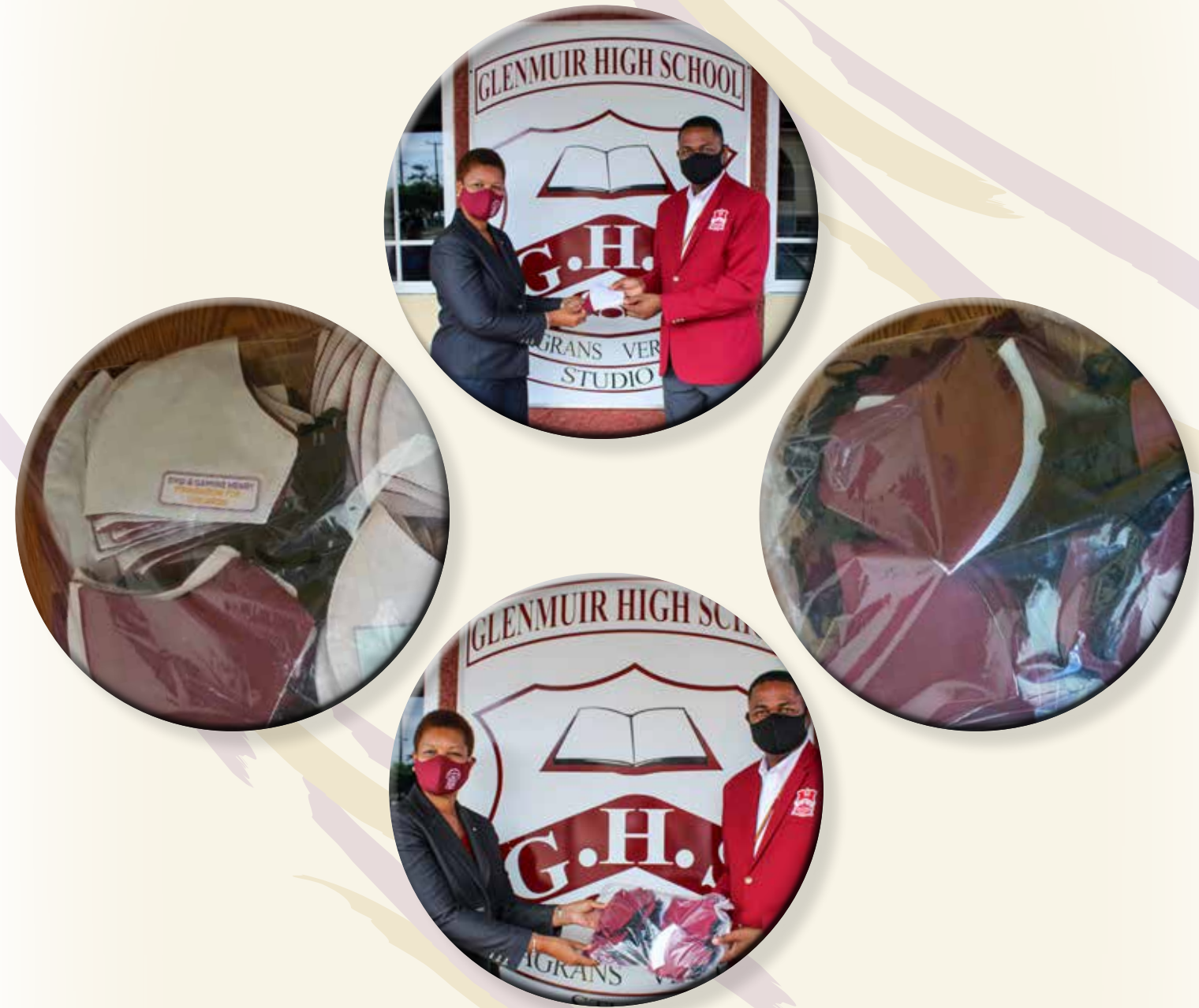
📍 Photos from our recent mask donation to the Glenmuir High School in Clarendon, Jamaica.